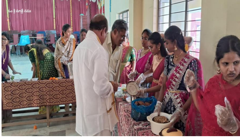
FOOD FEST ON THE OCCASION OF SANKRANTHI SAMBARALU